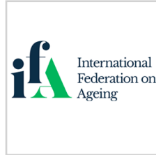
International Federation on Ageing